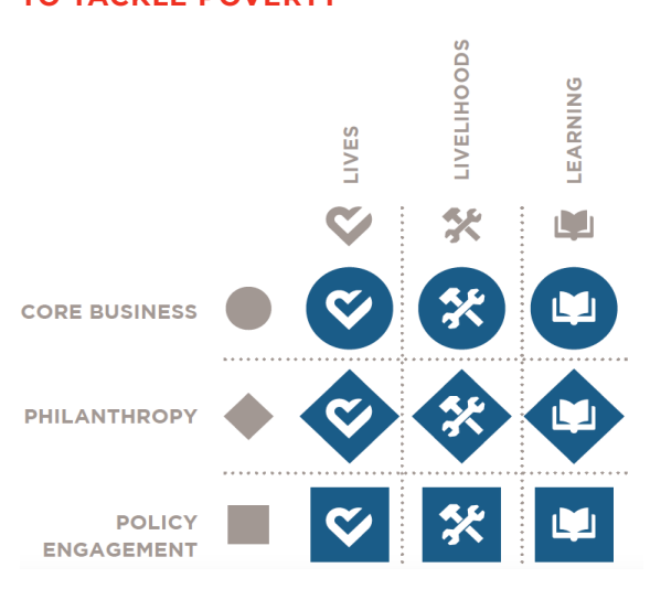
FIGURE 2: BUSINESS LEVERS TO TACKLE POVERTY

Beyond the clear moral imperative, we believe fighting poverty makes business sense—for example, by strengthening the resilience of supply chains or spurring innovation that serves the "base of the pyramid". Given the complex nature of poverty and the systemic barriers people face, our view is that we need to collaborate across business, government, and civil society with a new sense of urgency and purpose. We also believe we must listen to the voices of those most proximate to the challenges we are tackling, and we are committed to this in our approach.